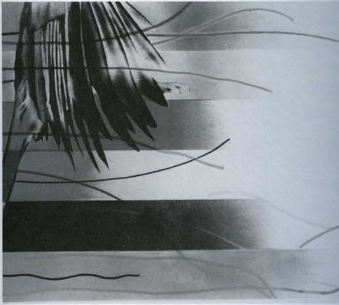
James Rosenquist, American, b. 1933 Area Code , 1969 two colored lithographs, 28 3 / 4 × 25 1 / 2 inches each Gift of Marjorie Lanston Fitzgerald (W&M '32)