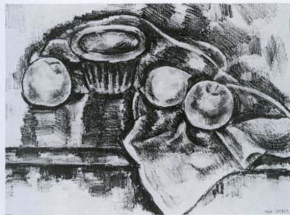
Max Weber, American, 1881-1961 Untitled Still Life colored lithograph, 12 1/4 x 16 inches Anonymous donor