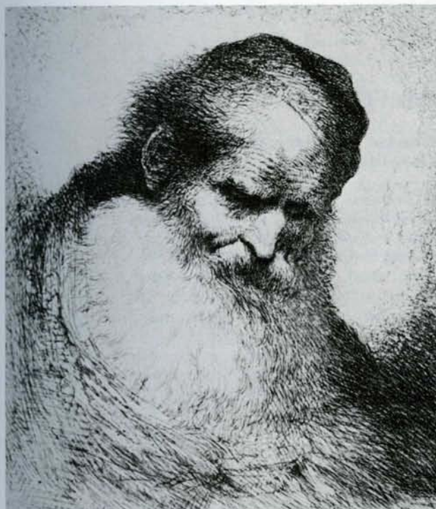
Giovanni Benedetto Castiglione, Italian, 1616-1670