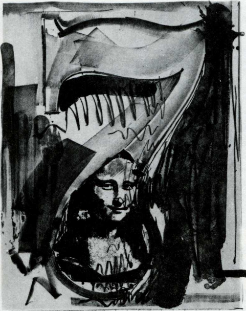
Jasper Johns, American, b. 1930 Number 7 , c. 1968 lithograph, 37 x 30 inches from the exhibition: Jasper Johns Prints

To receive a brochure on membership, contact the Museum office at 253-4650.