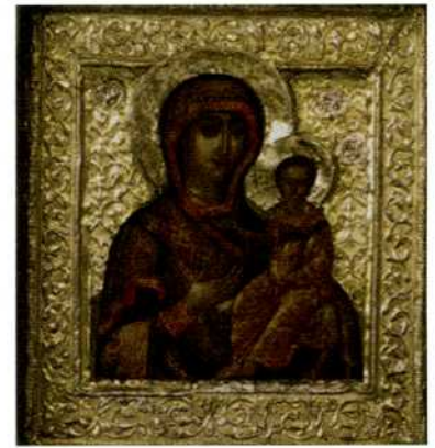
Kazan Mother of God, Russia, 17th C., Tempera on wood, metal, stones

Organized by the International Arts & Artists