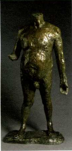
Lewis Cohen, Standing Male Figure , 1992, bronze