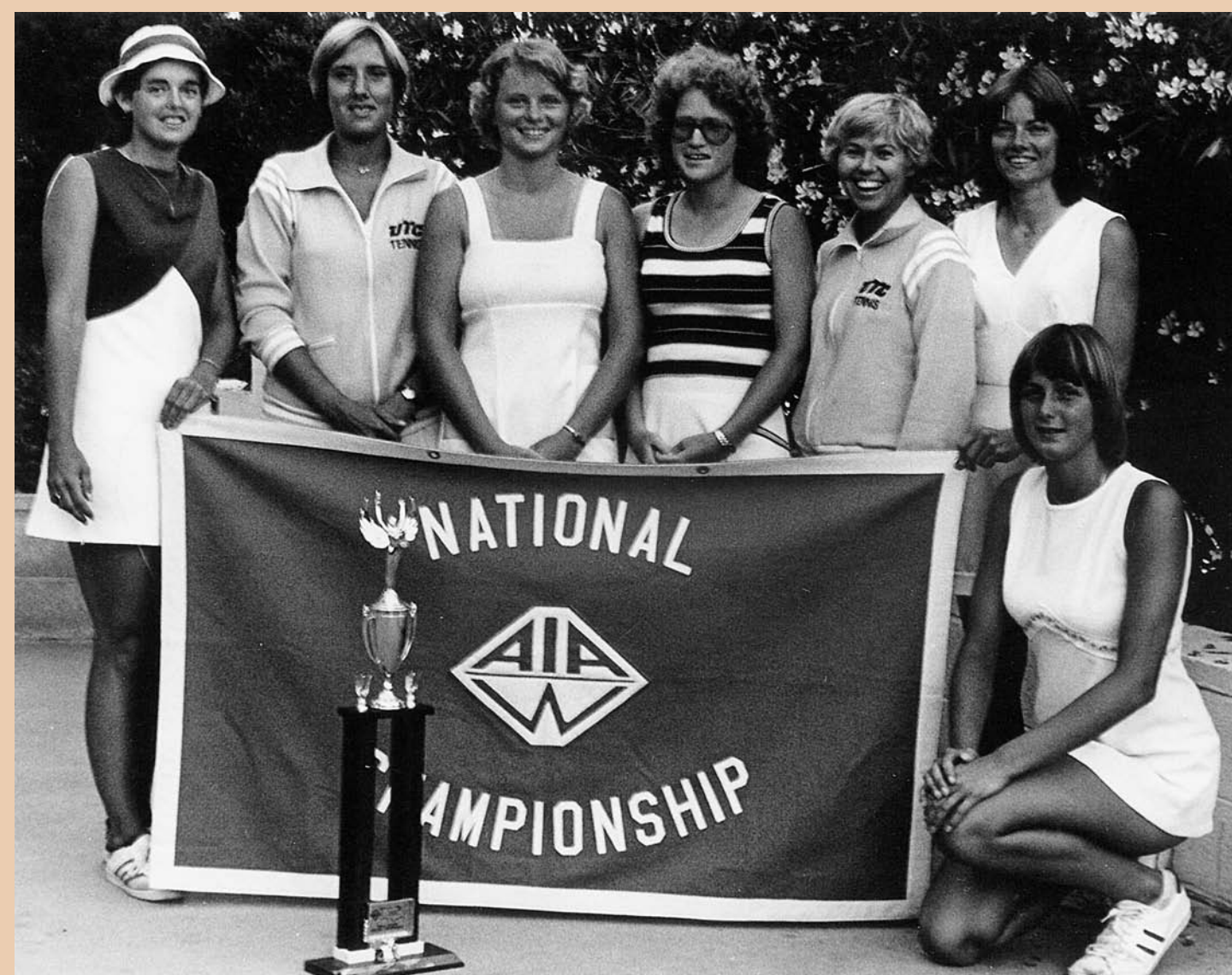
During Tym's tenure, all members of UTC's championship teams were named AIAW All-Americans.